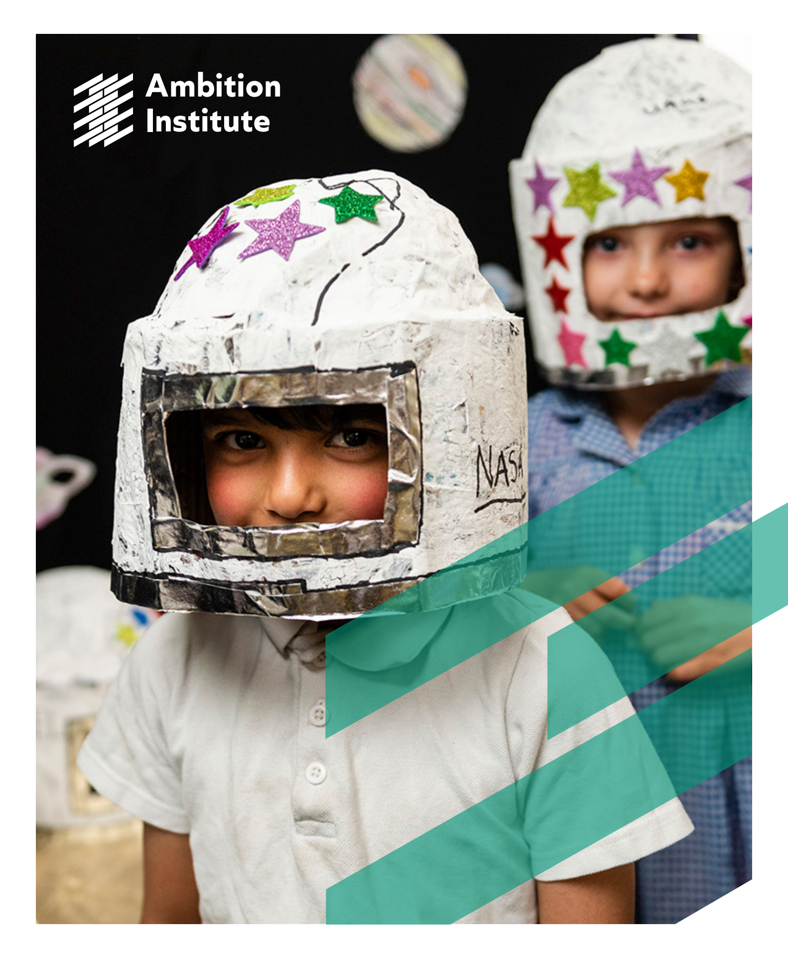
AMBITION INSTITUTE | JOB PACK: Trustee